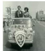
1973年，獲得十大傑出青年獎。 1973 Received the honor of the Ten Outstanding Young Persons in Taiwan.