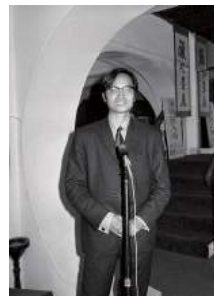
1972年，廖修平在臺北春秋藝廊發表演講。 1972 Liao Shiu-ping delivers a speech in Taipei.