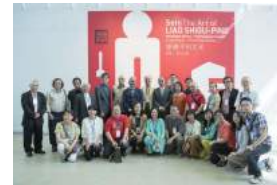
「廖修平的藝術：跨域·多元藝術」展覽現場來賓合影。

Participates in the opening exhibition of Tainan Art Museum: Taiwan Panegyric and Link to Taiwan: The retrospective exhibition of Wu San-Lien Prize winners .