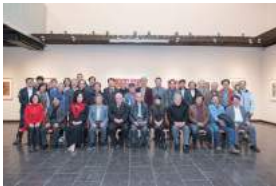
2016年，「版圖擴張—緣聚廖修平」於臺南文化中心展出之紀念合影。

2016, was awarded the 3rd Arts Education Contribution Award, Taiwan, R.O.C.