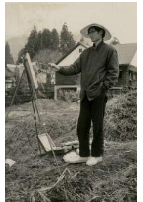
1963年，攝於東京近郊寫生旅行。 1963 during a sketching trip in the suburbs of Tokyo.