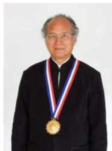
2010年，獲行政院第29屆文化獎。 2010, Receives the 29th National Cultural Award.

Participates in Creativity & Communication: Mainland China Traveling Exhibition of the Taiwan Academy of Fine Arts at the National Art Museum of China in Beijing and Guangdong Museum of Art.