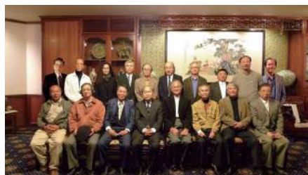
2009年 成立台灣美術院， 院士成員合影。 2009 members of the Taiwan Academy of Fine Arts.

Establishes Taiwan Academy of Fine Arts and is appointed as the Dean.