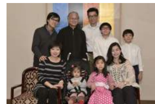
2014年，廖修平全家合影。 2014 A family photo of the Liao family.

2014 Liao Shiou-ping with his studio assistants, eldest son's family at the "A Symphony of Printmaking and Painting: the Art of Liao Shiou-Ping" exhibition at Kaohsiung Museum of Fine Arts.