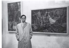
1960年今日畫展留影。 1960 taken at Le salon du Jour exhibition.