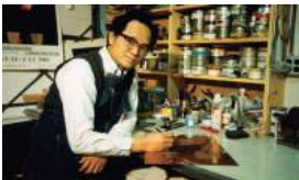
1985年攝於紐澤西畫室。