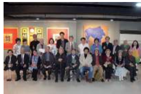
臺師大藝術系48級於臺師大德群藝廊聯展合影。

2017 at the Members Exhibition of Taiwan Academy of Fine Arts.