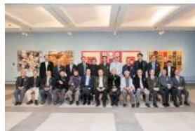
2017 臺灣美術院院士大展。

Participates in Art Made in Taiwan: Members Exhibition of Taiwan Academy of Fine Arts at the National Sun Yat-sen Memorial Hall.