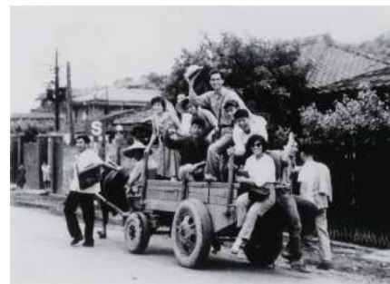
1957年，與同學郊遊寫生。 1957 On a sketching trip with classmates.

■ Universal Limited Art Editions (ULAE) 於紐約成立，建立版印師與藝術家合作標準，羅伯特·布雷克朋曾擔任主版印師。 Universal Limited Art Editions (ULAE) is founded in New York to establish collaborative standards between printers and artists. Robert Blackburn was once a master printer there.