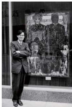
1964年於東京造型畫廊舉辦個展留影。 1964 at the solo exhibition held at Zokei Gallery in Tokyo.