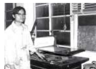
1973年廖修平攝於師大美術系版畫工作室。 1973 A photo of Liao Shiu-ping in the printmaking workshop of the Department of Fine Arts at NTNU.

Taiwan participates in the Bienal de São Paulo in a national pavilion for the last time.