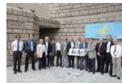
於臺灣美術院聯展「いま臺灣」展場留影。 At the Taiwan Modern Art Exhibition, Taiwan Academy of Fine Arts.

National Taiwan Normal University establishes the International Printmaking Center.