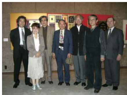
2009東京 松濤美術館 作品展。 2009 Solo exhibition at the Shoto Museum of Art in Tokyo.